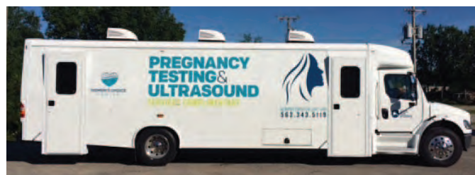
GRACE, our Mobile Medical Unit.

During those weeks, we prayed daily that this mother would have a change of heart, come to her follow-up appointment, and see her baby on the ultrasound screen. We were thrilled when this young woman not only returned to us for her follow-up ultrasound appointment, but also brought her own mother and the baby's father along for support. LIFE was chosen for this baby! In July, a Client Advocate from Women's Choice Center followed up with this young woman. A beautiful baby boy was born in June and Mom, Dad and baby are all doing wonderfully!